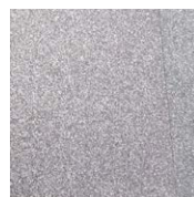
Sandblasted & brushed